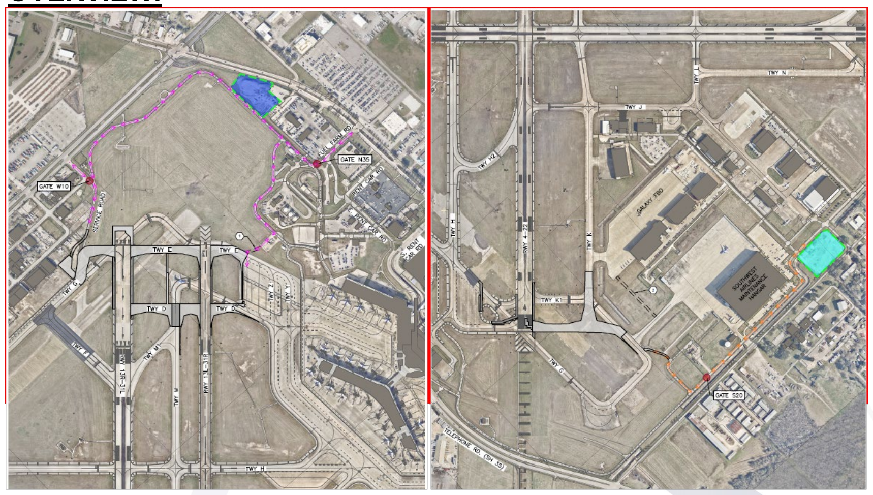
PN 770 FAA Non-Standard Taxiways