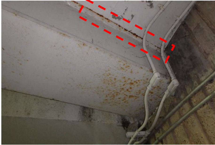
23 Corrosion of steel box girder